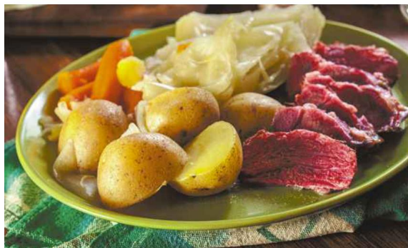
Corned beef and cabbage, a staple at restaurants on St. Patrick's Day